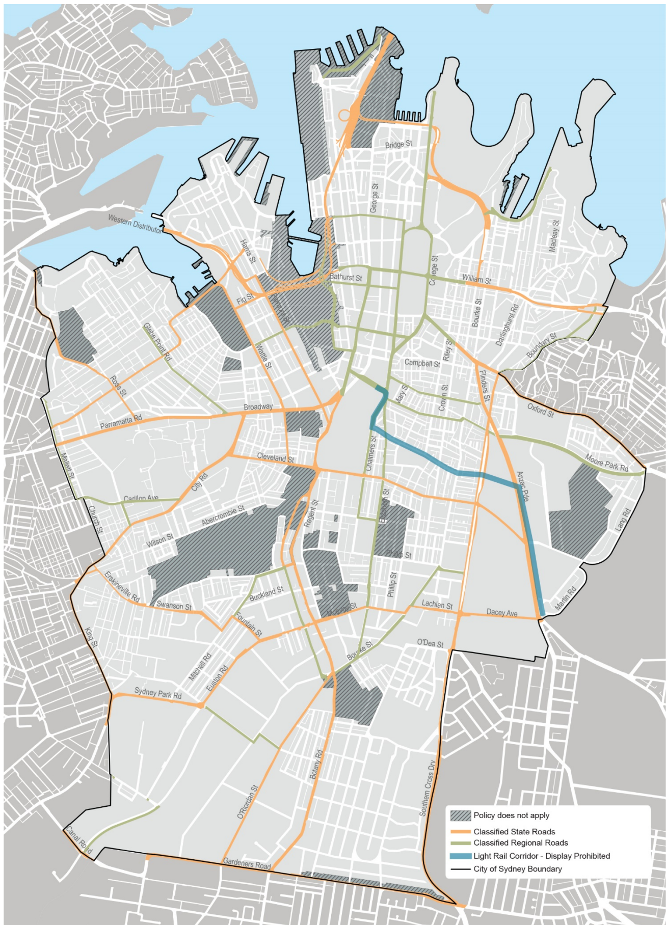
Figure 1 – Scope of Policy